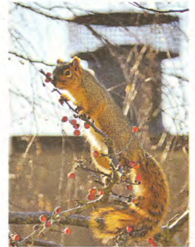
Found as often in suburban yards as in the wilds, Eastern Fox Squirrels (Sciurus niger) investigate many possible food sources, including the fruit on this crabapple tree.

Kay Loughman is a retired employee of Cal Libraries, a birder, a native plant gardener, and long-time resident of the Berkeley area. The North Hills Wild Life list (including photos) is published online at www.NHWildlife.net . She can be contacted at kayloughman@earthlink.net .