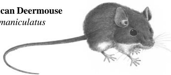
North American Deermouse Peromyscus maniculatus 4.8-9.0"