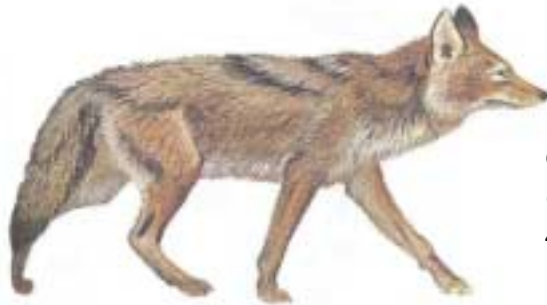
Coyote Canis latrans 43-70"