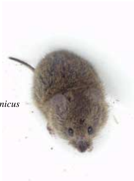
California Vole Microtus californicus 6.3-8.5"