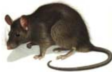
House Rat Rattus rattus 16"