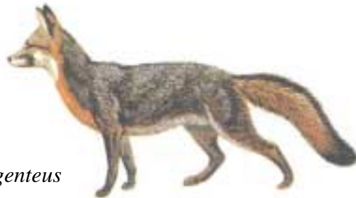
Gray Fox Urocyon cinereoargenteus 32-60"