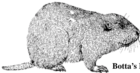
Botta's Pocket Gopher Thomomys bottae 6.8-10.75"