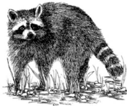
Northern Raccoon Procyon lotor 26-45"