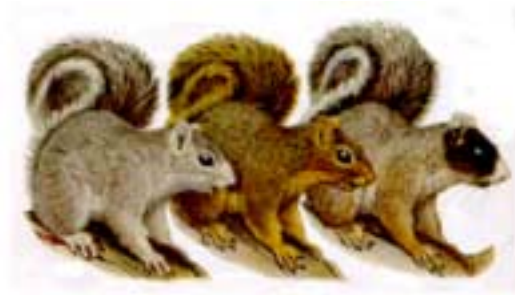
Three color phases of Fox Squirrel