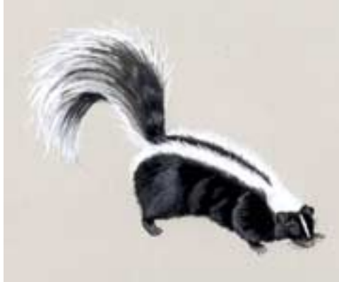
Striped Skunk Mephitis mephitis 20-28"