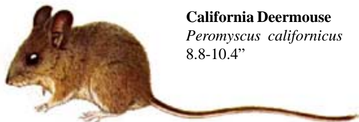
California Deermouse Peromyscus californicus 8.8-10.4"