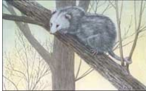
Virginia Opossum Didelphis virginiana 24-33"