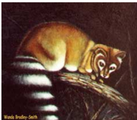
Ringtail Bassariscus astutus 33-36"