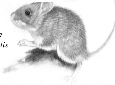
Western Harvest Mouse Reithrodontomys megalotis 5.0-6.2"