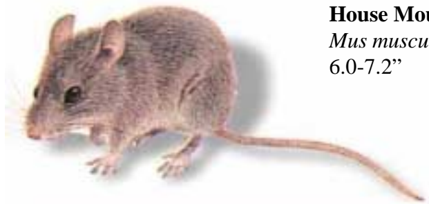
House Mouse Mus musculus 6.0-7.2"